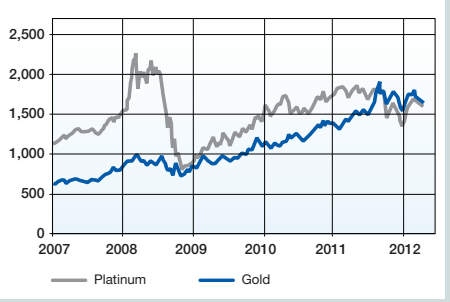
Figure 5: Gold vs Platinum US$/oz

Despite these difficulties, there are still deals being done. Reflecting China's rapid ascendancy in the commodity cycle chain, Chinese businesses have been looking to secure long term supply by acquiring platinum businesses overseas. Jinchuan Group acquired Wesizwe in June (see Spotlight on South Africa), which given the high cost structure of many South African platinum mines as well as the labour situation seems like a gamble to many.