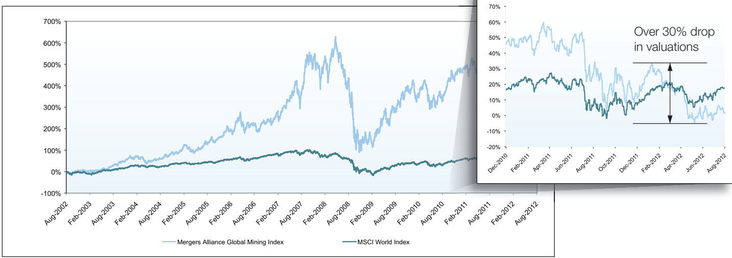
Figure 7: Mining composite valuation index